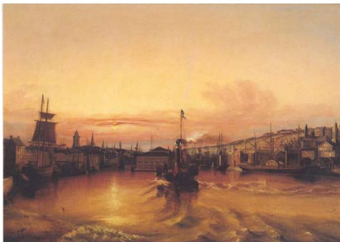
Paddle Steamer Entering Cork Harbour by George Mounsey Wheatley Atkinson (1806-1884)

Theme: Landscapes for urban, suburban and peri-urban areas